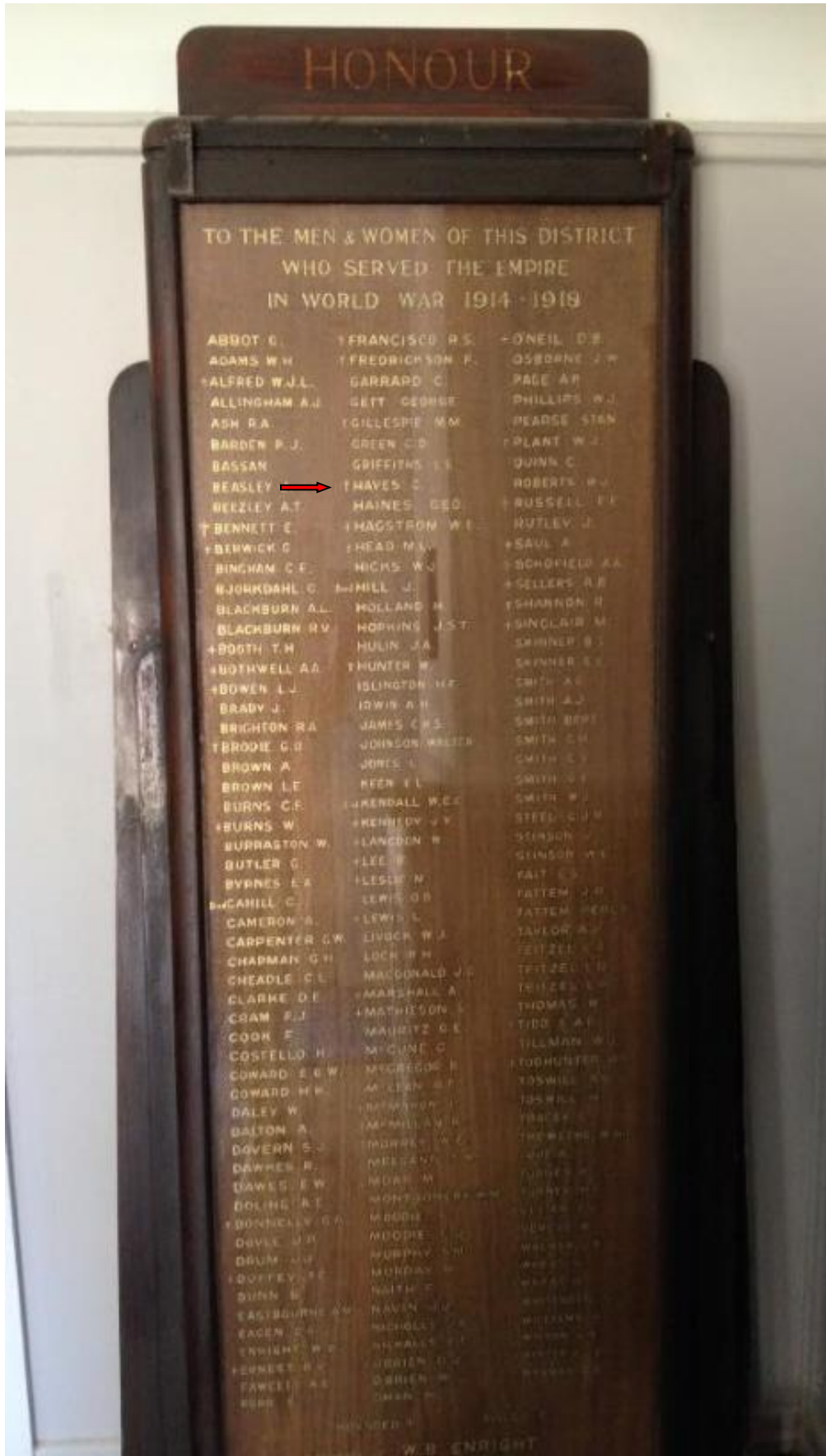
Mungindi District Roll of Honour